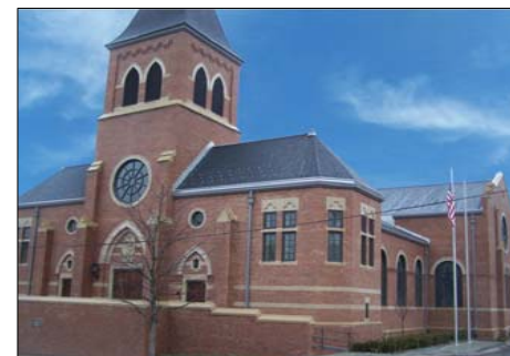
Institutional Category - Churches Sacred Heart Parish Church Weymouth, Massachusetts Architect: The S/L/A/M Collaborative Mason Contractor: Commercial Masonry Corporation Owner: Roman Catholic Archdiocese of Boston Engineer: The Collaborative Engineers