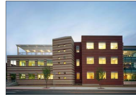
Best Contemporary Design Project - Brick & Stone Pfizer Clinical Research Unit New Haven, Connecticut Architect: The S/L/A/M Collaborative Mason Contractor: Lombardo Bros. Masonry, LLC Owner: Pfizer Corporation CM: Whiting-Turner Contracting Company Engineer: The S/L/A/M Collaborative