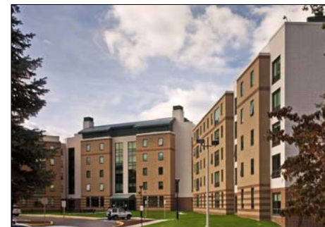
Best Sustainable Design Project New Residence Hall at Rhode Island College Providence, Rhode Island Architect: RGB Design Studio Mason Contractor: Costa Brothers Masonry Inc. CM: Bacon Construction Company Owner: Rhode Island College Engineer: Odeh Engineers, Inc.