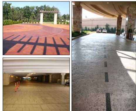
Special Award Project - Decorative Concrete Foxwoods Casino MGM Grand Hotel Ledyard, Connecticut J.L. Marshall & Sons, Inc.