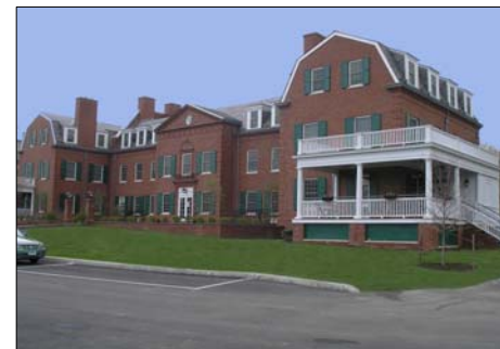
Best Structural Masonry & Design Project Flinn Hall & Edelman Hall Hotchkiss School - Lakeville, Connecticut Architect: Robert A M Stern Architects Mason Contractor: Lombardo Bros. Masonry, LLC CM: O & G Industries, Inc. Owner: Hotchkiss School Engineer: DeStefano Associates