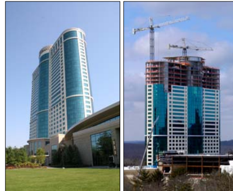
Special Award Project - Concrete Construction Foxwoods Casino MGM Grand Hotel Ledyard, Connecticut Manafort Brothers, Inc.