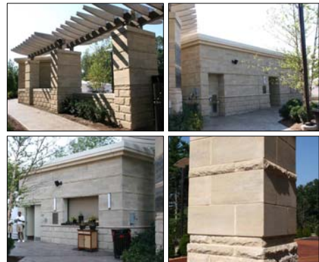
Special Award Project - Stone Masonry Foxwoods Casino MGM Grand Hotel Ledyard, Connecticut Acronom Masonry