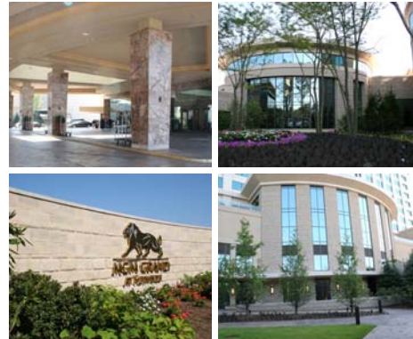
Special Award Project - Stone Masonry Foxwoods Casino MGM Grand Hotel Ledyard, Connecticut B.W. Dexter II, Inc.