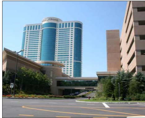
Special Award Project Foxwoods Casino MGM Grand Hotel Ledyard, Connecticut Architect: HKS, Inc Owner: Mashantucket Pequot Tribal Nation CM: Perini Building Company Engineer: Cagley Harman & Associates

New England Regional Office • 2 Park Plaza, Suite 315 • Boston, MA 02116 617-338-3199 • Fax: 617-426-9737 • 1-800-464-0988 • Email: sbolognese@imiweb.org • www.imiweb.org