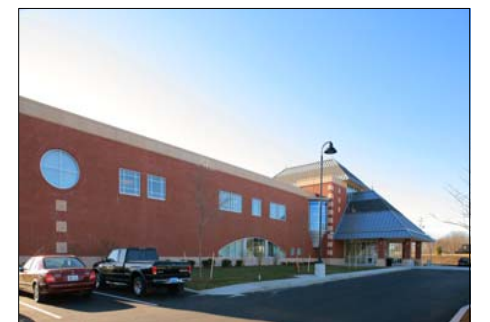
Institutional Category - Courthouses Rhode Island Traffic Tribunal Cranston, Rhode Island Architect: Edward Rowse Architects, Inc. Mason Contractor: M. DiSandro Masonry, Inc. CM: O. Ahlberg & Sons, Inc. Owner: State of Rhode Island Engineers: Odeh Engineers, Inc