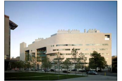
Best Contemporary Design Project - Stone Brain and Cognitive Sciences Complex, MIT Cambridge, Massachusetts Architect: Goody Clancy Mason Contractor: Kenneth Castellucci & Associates, Inc. CM: Turner Construction Company Owner: Massachusetts Institute of Technology Engineer: LeMessurier Consultants Inc.