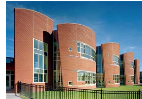
Best Contemporary Design Project - Brick John S. Martinez Elementary School New Haven, Connecticut Architect: Svigals + Partners, LLP Mason Contractor: B.W. Dexter II, Inc. Owner: City of New Haven CM: Fusco Corporation Engineer: Michael Horton Associates, Inc.