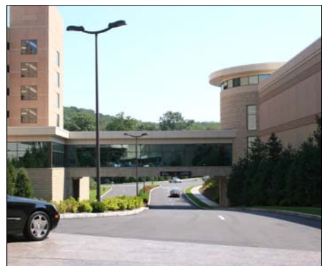
Special Award Project - Decorative Concrete Foxwoods Casino MGM Grand Hotel Ledyard, Connecticut RJB Contracting, Inc.