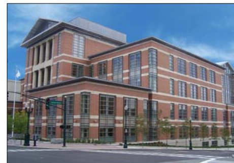
Institutional Category - Courthouses New Worcester Trial Court Worcester, Massachusetts Architect: Shepley Bulfinch Richardson & Abbott Mason Contractor: G.N. Prunier & Sons, Inc. CM: Gilbane Building Company Owner: Commonwealth of Massachusetts Engineer: Lee Lim Associates